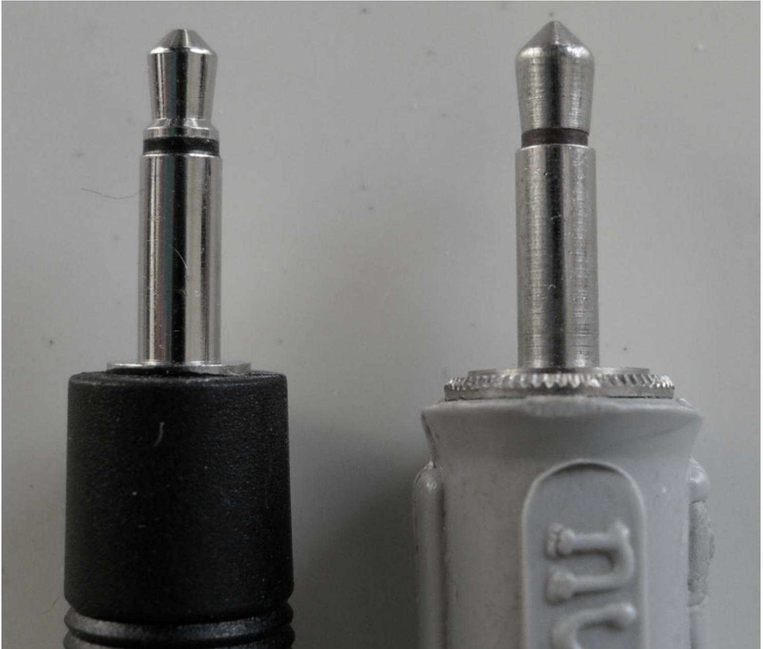
Tini Jax plug